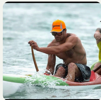
Jackson Tamaki Race Committee