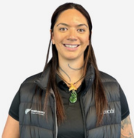
Maruwhare Harman Event Management